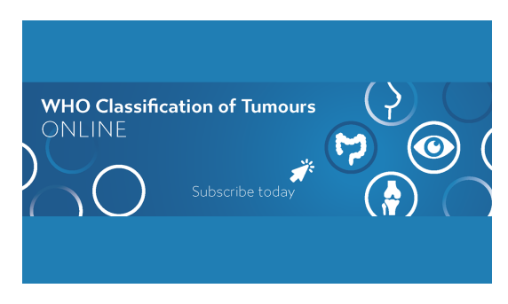
IARC makes available its <u>WHO Classification of Tumours</u> series in a convenient digital