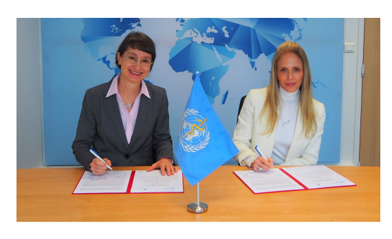
IARC and Hospital Israelita Albert Einstein (Brazil) signed a Memorandum of Understanding to increase collaboration