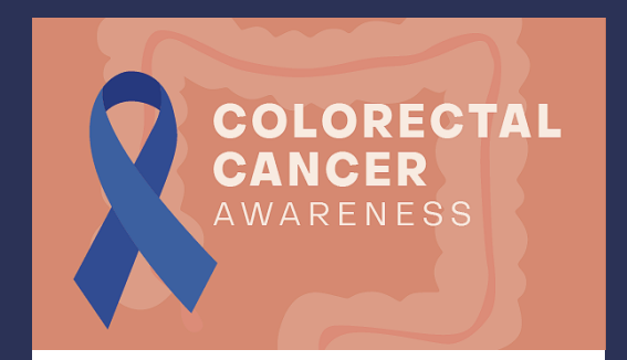
March is Colorectal Cancer Awareness Month