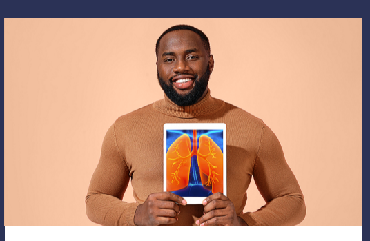
Achieving equity in lung cancer screening for Black individuals